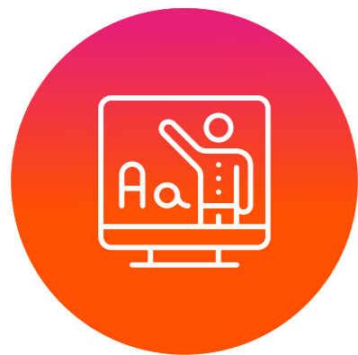
DEVELOP YOUR TEAM

Skills for Growth - SME Support is a fully funded, tailored service to help up-skill your employees and improve productivity. Delivered by GC Business Growth Hub in partnership with the Greater Manchester Chamber of Commerce, the service is funded through the European Social Fund and commissioned by the Greater Manchester Combined Authority, to help your business grow through re-shaping, developing your talent and enhancing team performance.