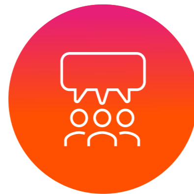
RE-SHAPE YOUR BUSINESS