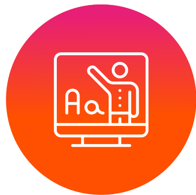
DEVELOP YOUR TEAM

Skills for Growth - SME Support is a fully funded, tailored service to help up-skill your employees and improve productivity. Delivered by GC Business Growth Hub in partnership with the Greater Manchester Chamber of Commerce, the service is funded through the European Social Fund and commissioned by the Greater Manchester Combined Authority, to help your business grow through re-shaping, developing your talent and enhancing team performance.